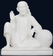
SAIBABA 104 / 12"-15"-18"-24"-30"