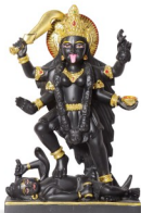
DVI12 / 12"