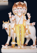
DT103 / 12"-15"-18"-24"-36"