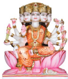
GY105 / 10"