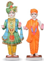
SW115 / 24"