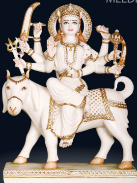
DI101 / 12" - 15" - 18" - 24" - 36" (MELDI MATAJI)