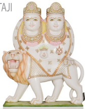
Ch101 / 36"