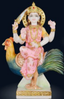
BH103 / 12" 15" 18" 24"