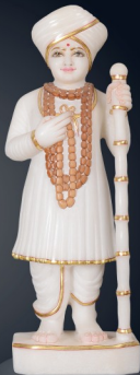
JALARAM BAPA 103 / 12"-15"-18"-24"