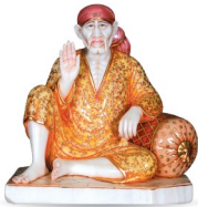
SAIBABA 102 / 12"-15"-18"-24"-30"