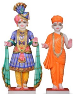
SW110 / 18"