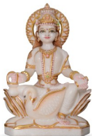
GY107 / 12"