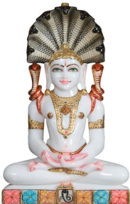
JN104 / 7"-9"-11"-15"-21"-25"-35"