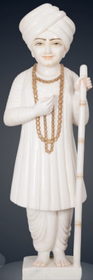
JALARAM BAPA 102 / 30"