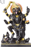
DVI10 / 12"