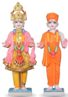
SW114 / 24"