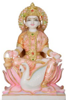
GY103 / 15"