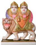
Ch104 / 12"