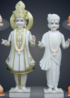
SW105 / 12"-15"-18"-24"-36"