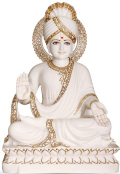
SW101 / 36"