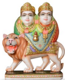
Ch102 / 12"