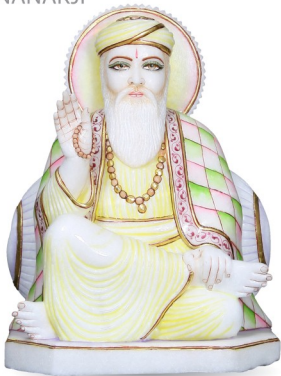
GURUNANAKJI 001 / 12"-15"-18"-24"-36"