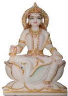
GY106 / 12"