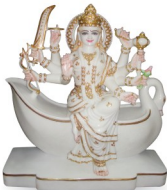
DV105 / 12"-15"-18"-24"-36" (AHAWATI MATAJI)