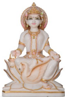
GY104 / 15"