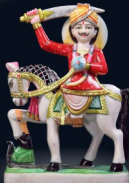
BHATHARI / 12" 15" 18" 24" 36"