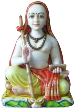
SHANKARACHARYAJI / 12"-15"-18"-24"-36"