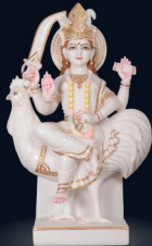
BH102 / 30"