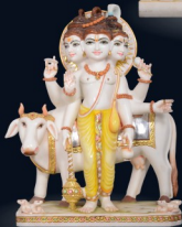
DT102 / 12"-15"-18"-24"-36"