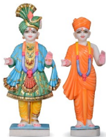
SW108 / 18"