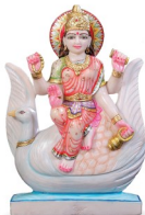
DV107 / 12"-15"-18"-24"-36" (BRAHMANI MATAJI)