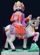
RAMDEVPIRJI 102 / 12" 15" 18" 24" 36"