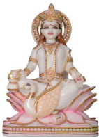
GY102 / 15"