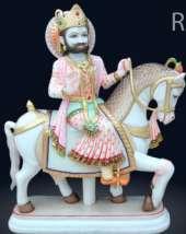
RAMDEVPIRJI 101 / 12" 15" 18" 24" 36"