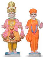
SW109 / 18"