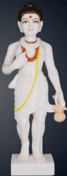
SW113 / 15" 18" 24" 30"