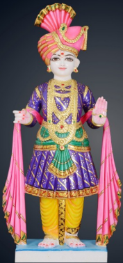
SW112 / 28"