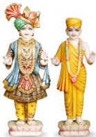
SW107 / 18"