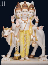
DT101 / 12"-15"-18"-24"-36"