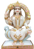
DV104 / 12"-15"-18"-24"-36" (BHAIJAL MATAJI)